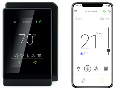
Allure UNITOUCH and myPERSONIFY State-of-the-art touchscreen user interface and mobile application