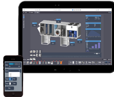
ENVYSION Responsive, web-based graphic design and visualization interface