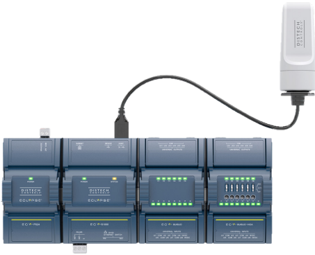
ECLYPSE Controller Series Connected IP and wi-fi product series